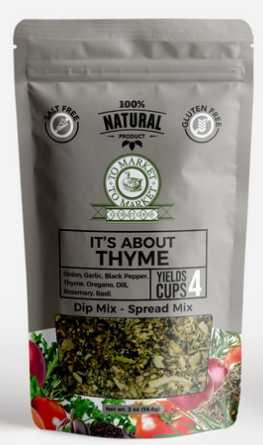
IT'S ABOUT THYME Thyme Seasoning & Dip Mix INGREDIENTS: Onion, Garlic, Black Pepper, Thyme, Oregano, Dill, Rosemary, Basil