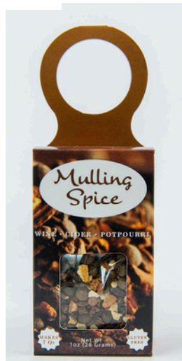
MULLING SPICE (1 oz) Cinnamon Chips, Orange Peel, Allspice, Cloves