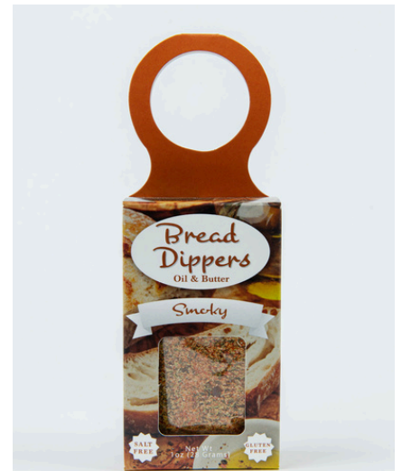
SMOKY BREAD DIPPER (1 oz) Roasted Garlic, Smoked Paprika, Basil, Rosemary, Tomato, Black Pepper, Onion, Red Pepper