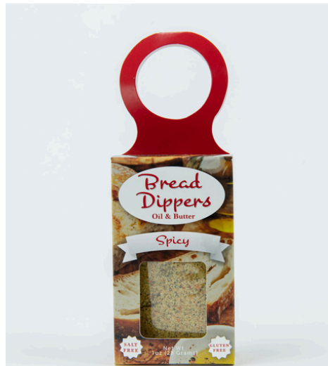
SPICY BREAD DIPPER (1 oz) Roasted Garlic, Jalapeno, Basil, Tomato, Onion, Black Pepper, Red Pepper, Rosemary