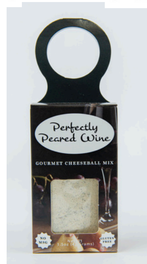
PERFECTLY PEARED WINE (1.5 oz) Sugar, Onion, Garlic, Salt, Basil, Natural Pear Flavors, and less than 2% Calcium Silicate to Prevent Caking