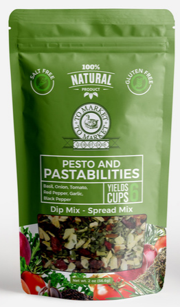
PESTO & PASTABILITIES Pesto Seasoning & Dip Mix INGREDIENTS: Basil, Onion, Tomato, Red Bell Pepper, Garlic, Black Pepper