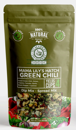
MAMA LILY'S HATCH GREEN CHILI CHILI Green Chili Dip Mix INGREDIENTS: Hatch Green Chili, Onion, Cilantro, Tomato, Garlic, Black Pepper, Cayenne