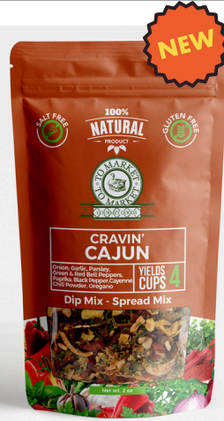
CRAVIN' CAJUN Cajun Dip Mix INGREDIENTS: Onion, Garlic, Parsley, Green & Red Bell Peppers, Paprika, Black Pepper, Cayenne, Chili Powder, Oregano