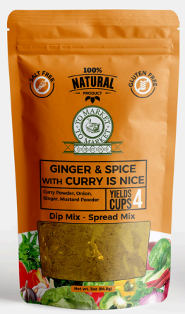
GINGER & SPICE WITH CURRY IS NICE NICE Ginger & Curry Spice Blend INGREDIENTS: Ginger, Curry, Onion, Mustard