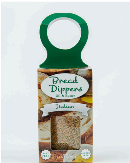
ITALIAN BREAD DIPPER (1 oz) Roasted Garlic, Oregano, Basil, Tomato, Black Pepper, Onion, Rosemary, Paprika