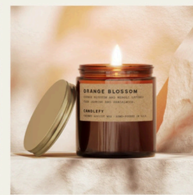
Orange Blossom - Scented Candle