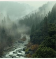
Woods & Earth