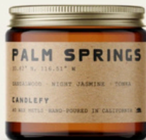
Palm Springs - Wax Melts