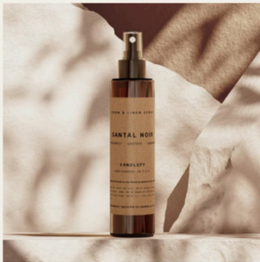
Santal Noir - Room & Linen Spray