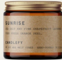
Sunrise - Wax Melts