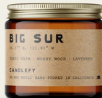
Big Sur - Wax Melts