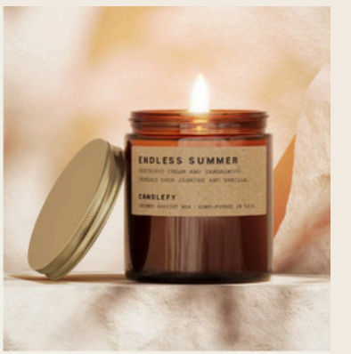
Endless Summer - Scented Candle