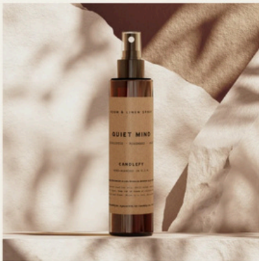
Quiet Mind - Room & Linen Spray