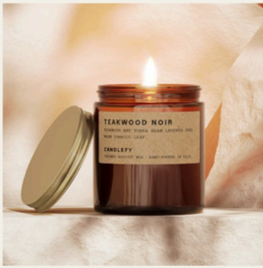
Teakwood Noir • Scented Candle