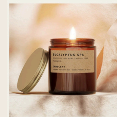
Eucalyptus Spa - Scented Candle