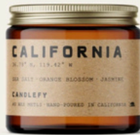
California - Wax Melts