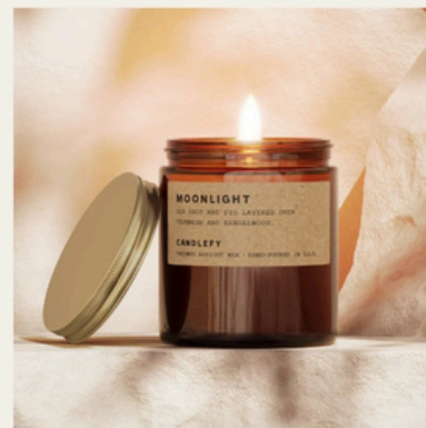
Moonlight - Scented Candle