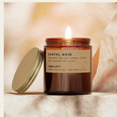
Santal Noir - Scented Candle