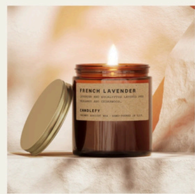
French Lavender - Scented Candle