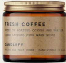
Fresh Coffee - Wax Melts