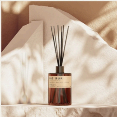
Big Sur · Reed Diffuser