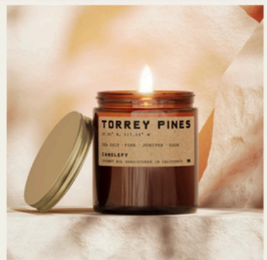
Torrey Pines Candle