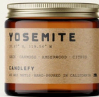
Yosemite - Wax Melts