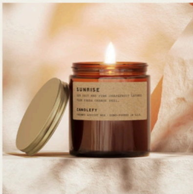
Sunrise - Scented Candle