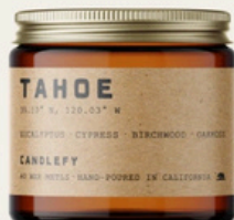
Lake Tahoe - Wax Melts