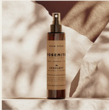
Yosemite · Room & Linen Spray