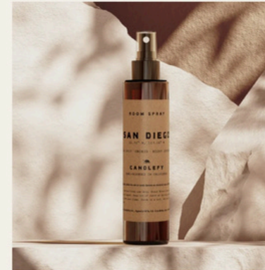
San Diego · Room & Linen Spray