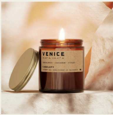
Venice Beach Candle