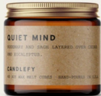
Quiet Mind · Wax Melts