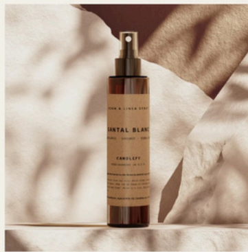
Santal Blanc - Room & Linen Spray