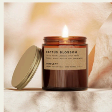
Cactus Blossom - Scented Candle