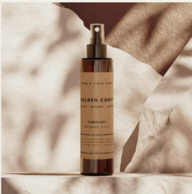
Golden Coast - Room & Linen Spray