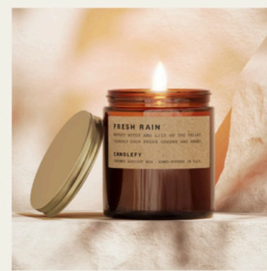
Fresh Rain - Scented Candle