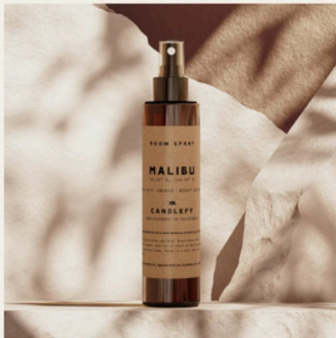
Malibu · Room & Linen Spray