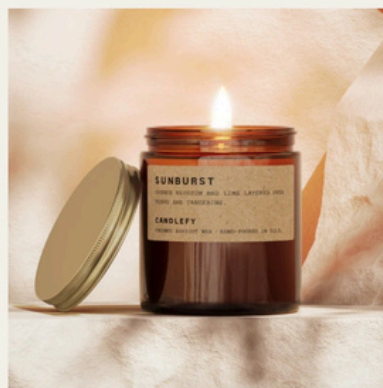
Sunburst - Scented Candle