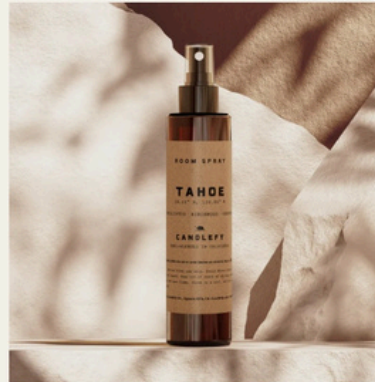
Tahoe · Room & Linen Spray