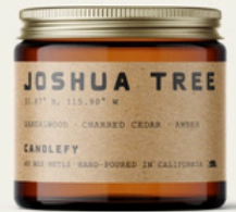
Joshua Tree - Wax Melts