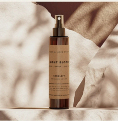
Night Bloom - Room & Linen Spray