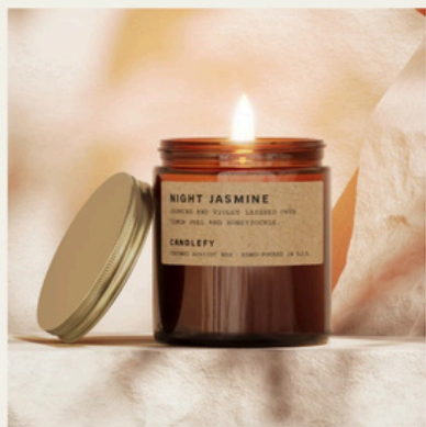
Night Jasmine - Scented Candle