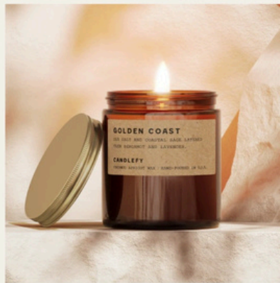
Golden Coast - Scented Candle