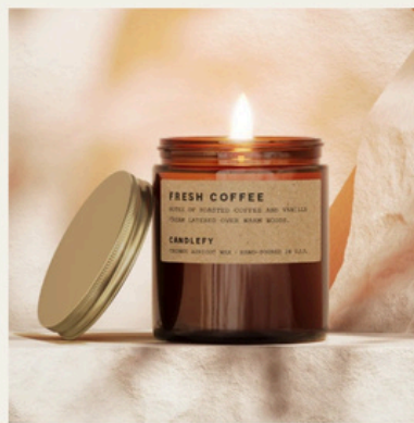
Fresh Coffee - Scented Candle