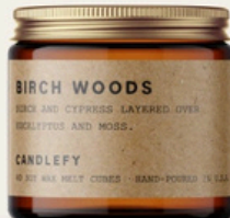
Birch Woods · Wax Melts