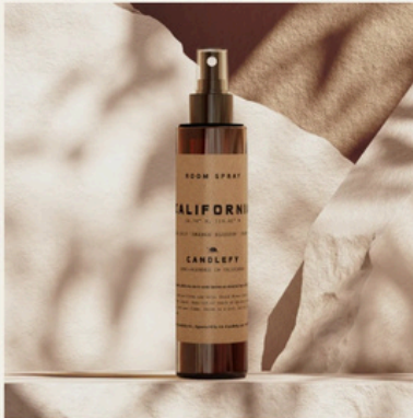
California · Room & Linen Spray