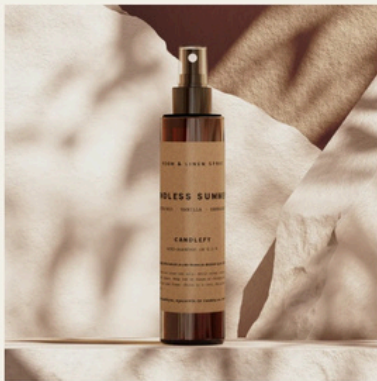
Endless Summer - Room & Linen Spray