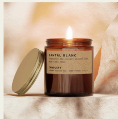
Santal Blanc - Scented Candle