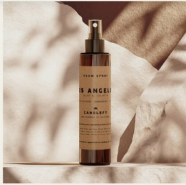
Los Angeles · Room & Linen Spray