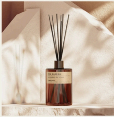
Zen Garden · Reed Diffuser