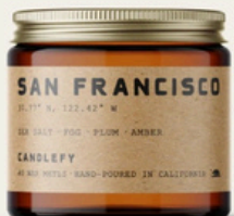
San Francisco - Wax Melts