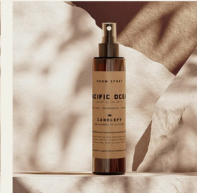
Pacific Ocean · Room & Linen Spray