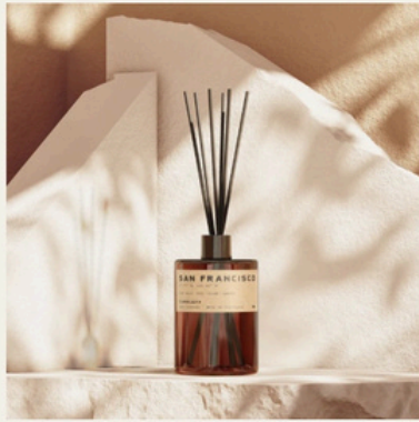
San Francisco · Reed Diffuser