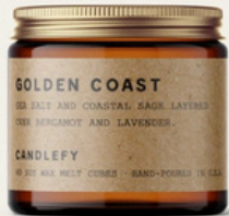
Golden Coast · Wax Melts