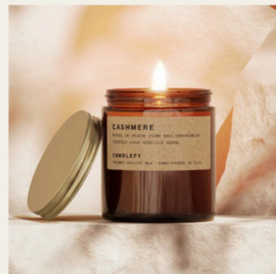
Cashmere - Scented Candle