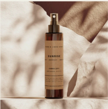
Sunrise - Room & Linen Spray