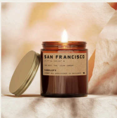
San Francisco Candle