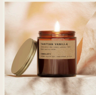
Tahitian Vanilla - Scented Candle