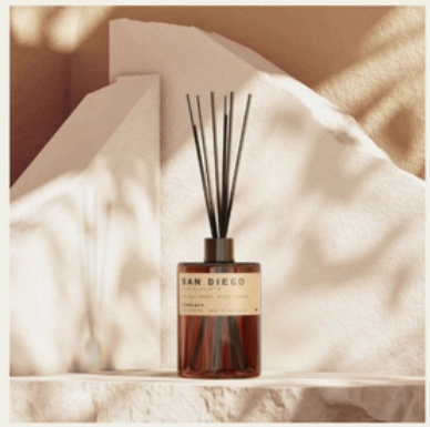
San Diego · Reed Diffuser