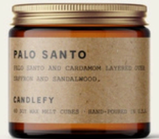
Palo Santo · Wax Melts