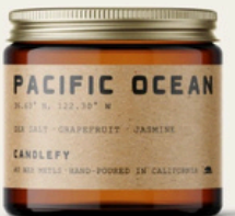
Pacific Ocean - Wax Melts