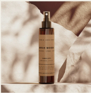
Birch Woods - Room & Linen Spray