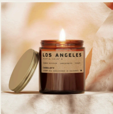
Los Angeles Candle