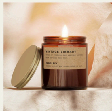
Vintage Library - Scented Candle