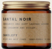
Santal Noir · Wax Melts