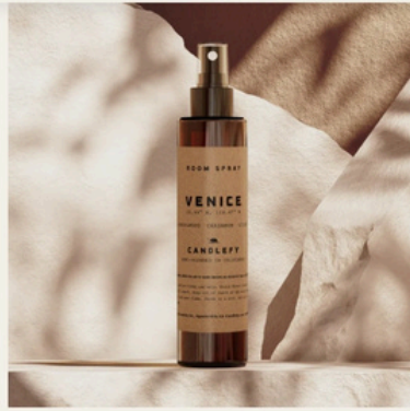
Venice · Room Spray