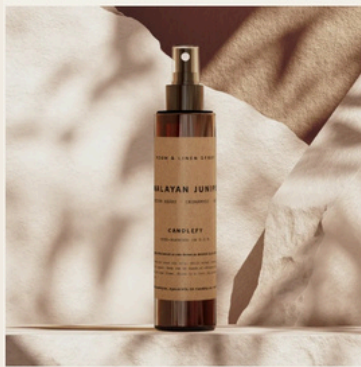
Himalayan Juniper - Room & Linen Spray