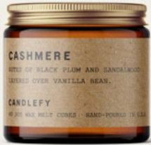
Cashmere - Wax Melts