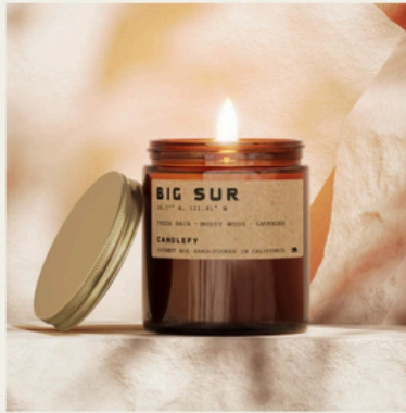
Big Sur Candle