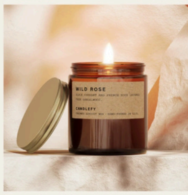
Wild Rose - Scented Candle