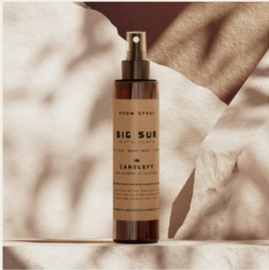
Big Sur · Room & Linen Spray