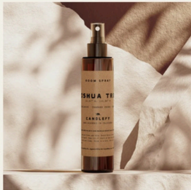
Joshua Tree · Room & Linen Spray