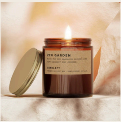
Zen Garden - Scented Candle