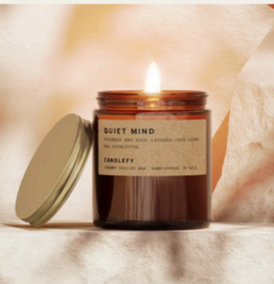
Quiet Mind - Scented Candle