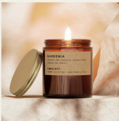
Gardenia - Scented Candle