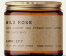
Wild Rose · Wax Melts