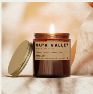
Napa Valley Candle