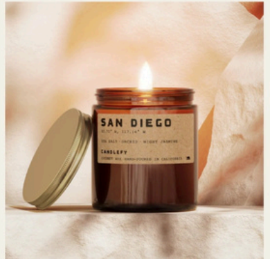
San Diego Candle