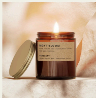
Night Bloom - Scented Candle