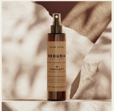
Sequoia · Room & Linen Spray