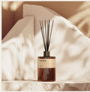
Tahoe · Reed Diffuser