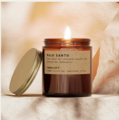
Palo Santo - Scented Candle