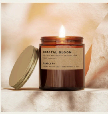
Coastal Bloom - Scented Candle