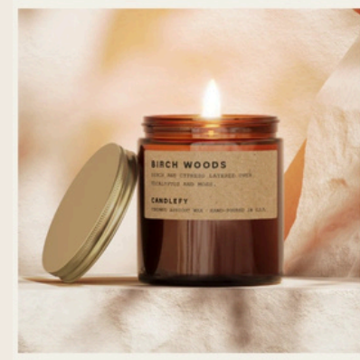
Birch Woods - Scented Candle