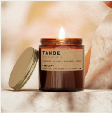
Lake Tahoe Candle