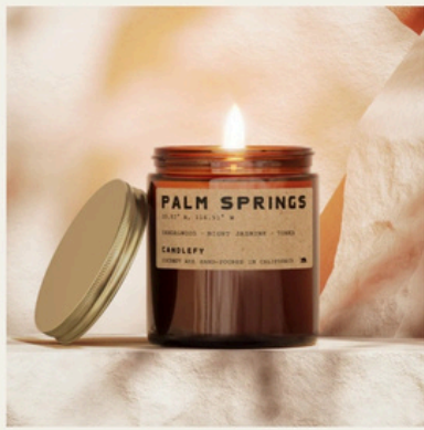
Palm Springs Candle