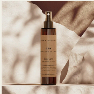
Zen - Room & Linen Spray