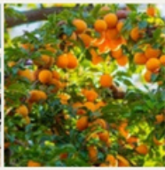
Citrus & Bright