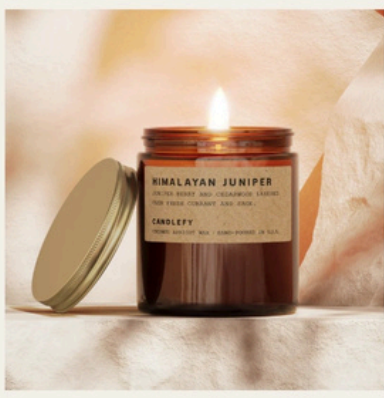
Himalayan Juniper - Scented Candle