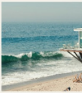
Coastal & Airy