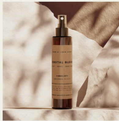
Coastal Bloom - Room & Linen Spray