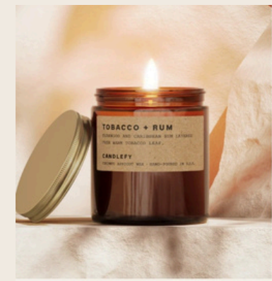
Tobacco Rum - Scented Candle