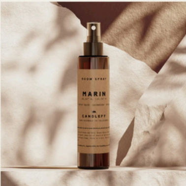
Marin · Room & Linen Spray