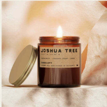
Joshua Tree Candle