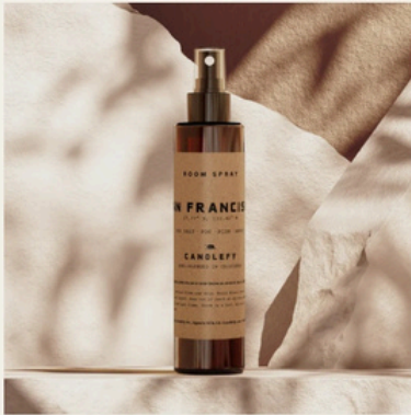
San Francisco · Room & Linen Spray