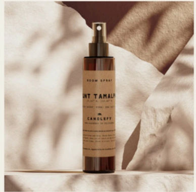
Mount Tamalpais · Room & Linen Spray