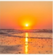
Warm & Cozy