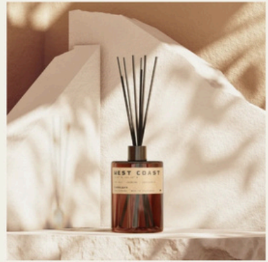
West Coast · Reed Diffuser