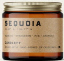
Sequoia Redwood - Wax Melts

Designed to bring a sense of California into everyday spaces.