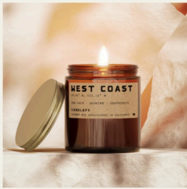
West Coast Candle