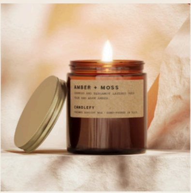
Amber + Moss - Scented Candle