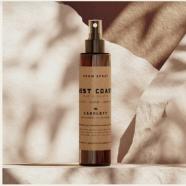
West Coast · Room Spray