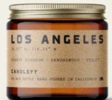
Los Angeles - Wax Melts