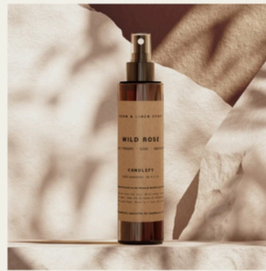
Wild Rose - Room & Linen Spray