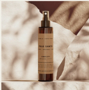
Palo Santo - Room & Linen Spray