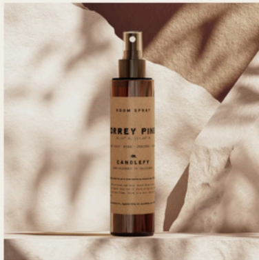
Torrey Pines · Room & Linen Spray