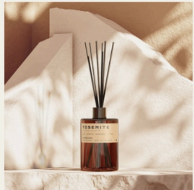
Yosemite · Reed Diffuser