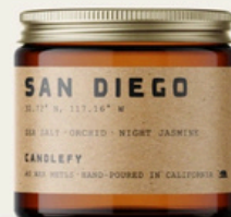
San Diego - Wax Melts