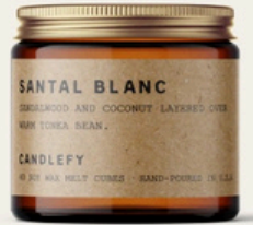
Santal Blanc - Wax Melts