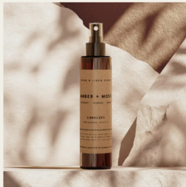
Amber + Moss - Room & Linen Spray