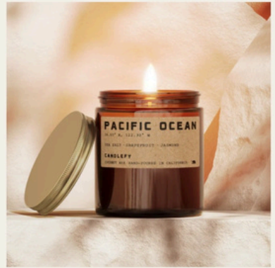
Pacific Ocean Candle