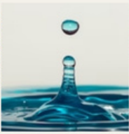
Fresh & Clean