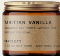
Tahitian Vanilla · Wax Melts