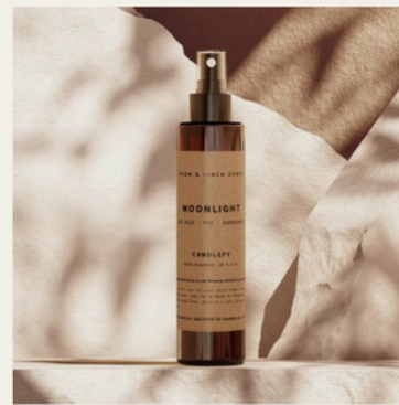
Moonlight - Room & Linen Spray