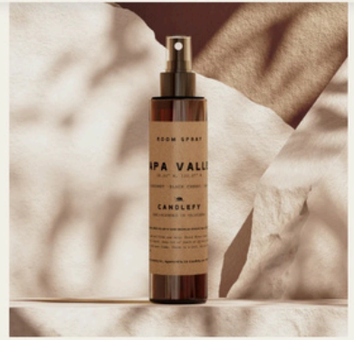
Napa Valley · Room & Linen Spray