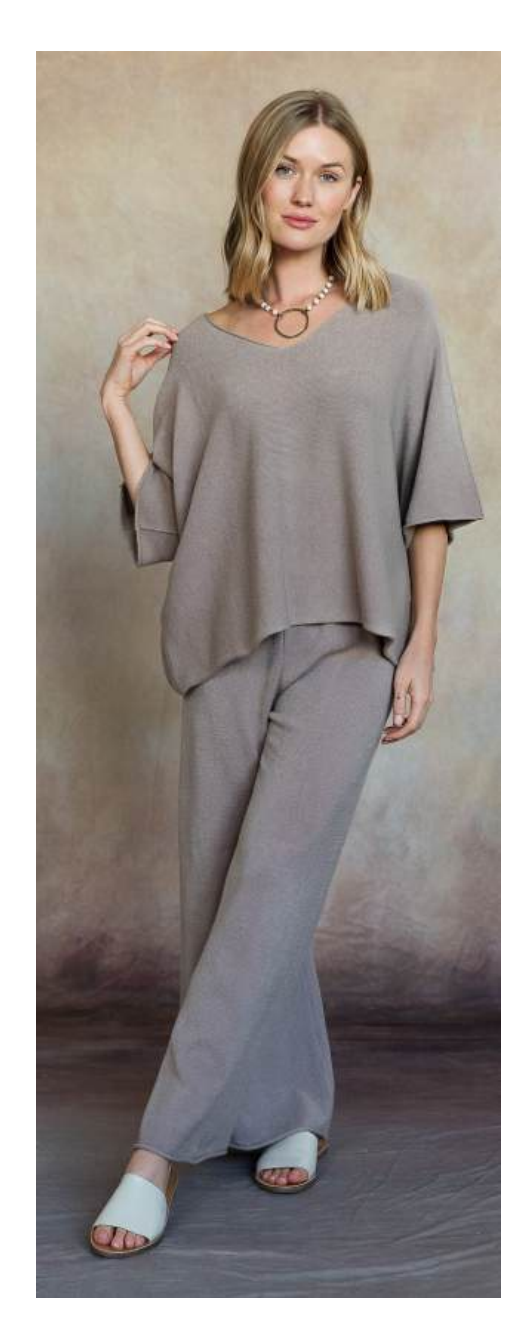
Taupe (CLEO-TP), Ivory (CLEO-IV), Grey (CLEO-GR) One size fits most | $42

Enjoy unparalleled comfort and effortless style with Cleo. These wide-leg wonders offer a flattering fit that moves with you, perfect for transitioning between seasons and a wardrobe staple. Pair them with our coordinating knit tops and outerwear for stunning head-to-toe looks.