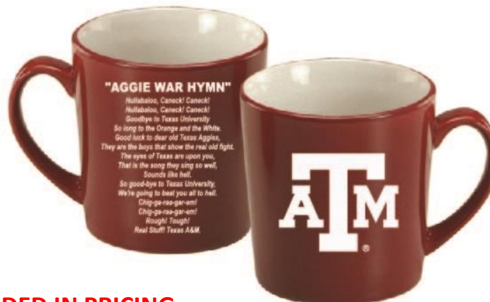
#4532M/W 21 OZ. MAROON/WHITE NICHOLAS MUG $7.50