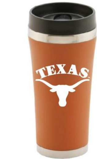
#SF6155BO 16 OZ. BURNT ORANGE SATIN FINISH JV TRAVEL TUMBLER $8.50