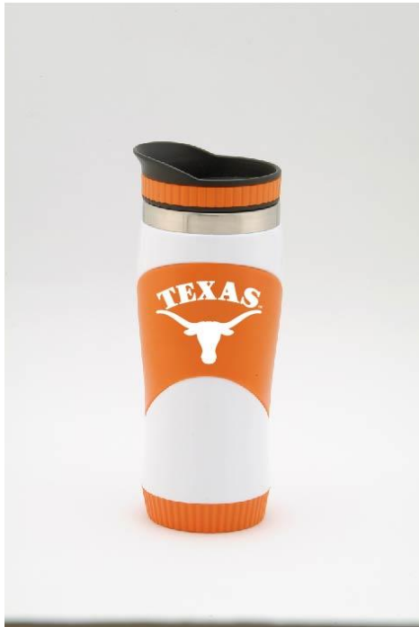
#6121BO/W 16 OZ. SCHOOL SPIRIT STAINLESS TUMBLER $5.00