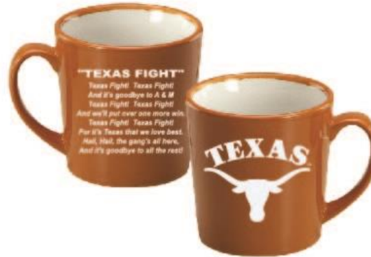
#4532BO/W 21 OZ. BURNT ORANGE/WHITE NICHOLAS MUG $7.50