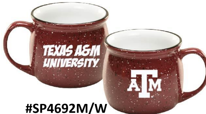
#SP4692M/W 16 OZ. MAROON/WHITE COLONIAL MUG $5.00