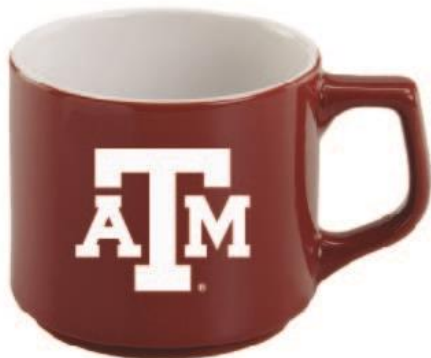
#4225M/W 16 OZ. MAROON/WHITE JULIE MUG $5.00