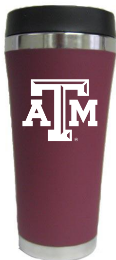
#SF6155M 16 OZ. MAROON SATIN FINISH JV TRAVEL TUMBLER $8.50