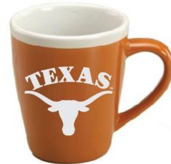
#4671BO/W 18 OZ. BURNT ORANGE/WHITE SOPHIA MUG $7.50