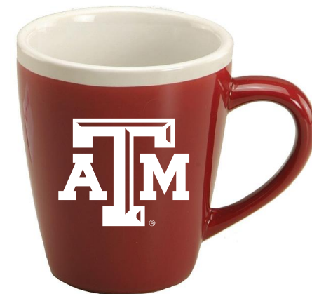
#4671M/W 18 OZ. MAROON/WHITE SOPHIA MUG $7.50