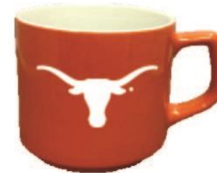
#4225BO/W 16 OZ. BURNT ORANGE/WHITE JULIE MUG $5.00