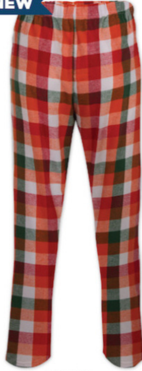
BP2 Autumn Buffalo Check