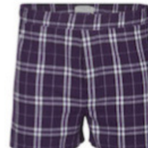
PWP Purple White Plaid