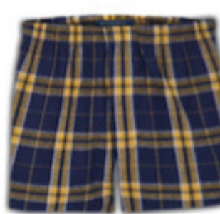
NGP Navy Gold Plaid