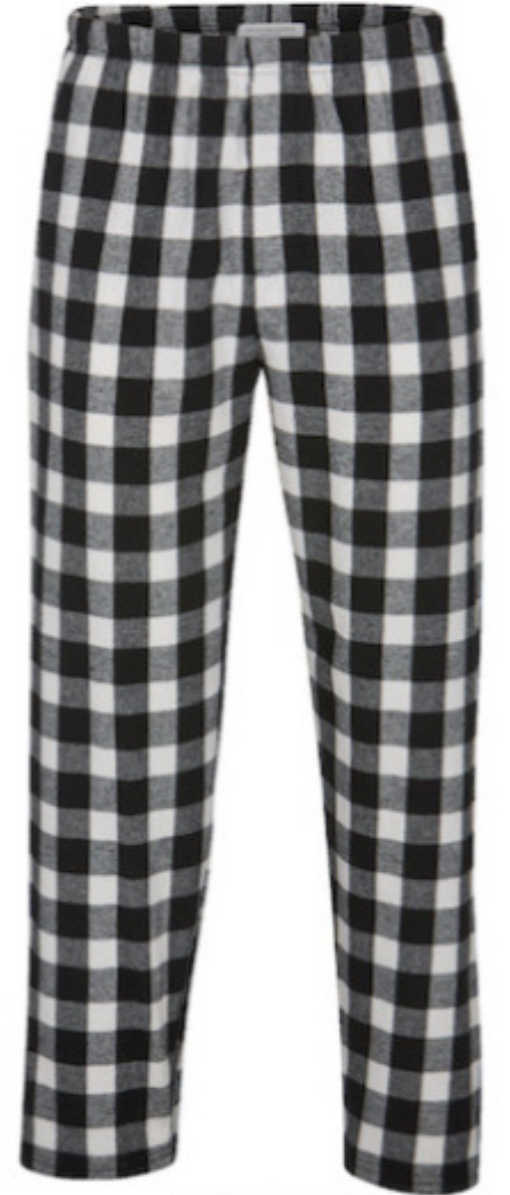
BWF Black White Buffalo Check