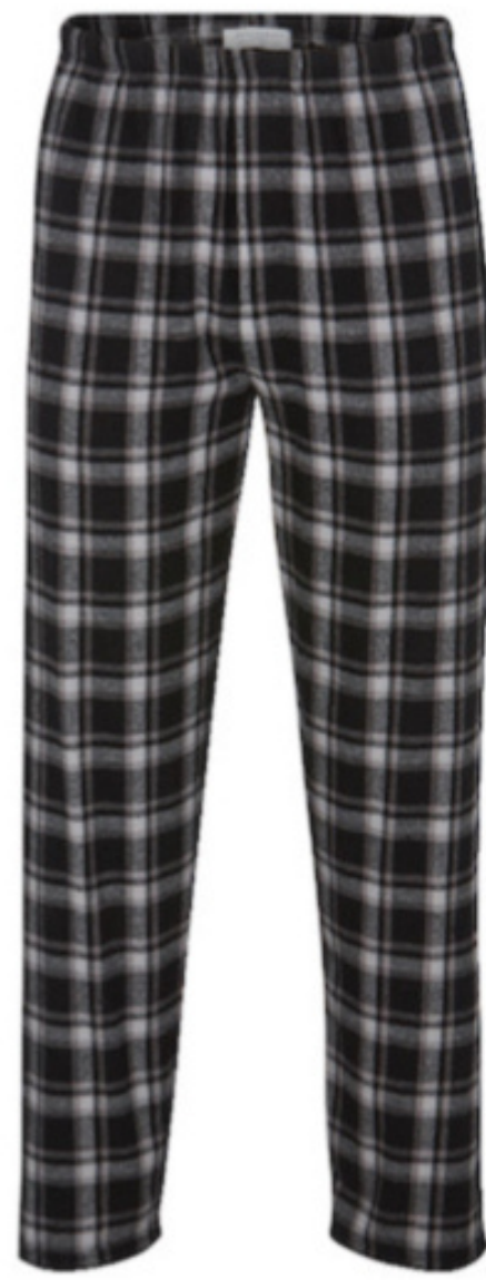
HEB Heritage Black Plaid

Plaids consist of crossed horizontal and vertical bands in two or more colors. Plaids have many variations of band width, repeat and/or color.