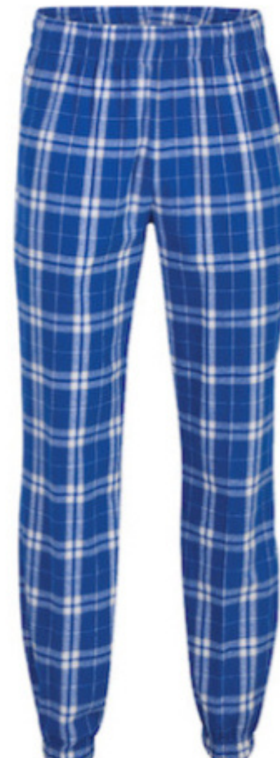
RSV Royal Silver Plaid