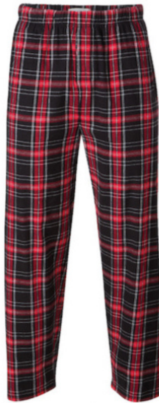
H04 Black Red Kingston Plaid

Instant classics with bold colors and styling.