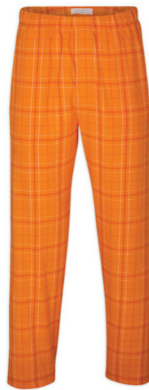
FD4 Orange Field Day Plaid