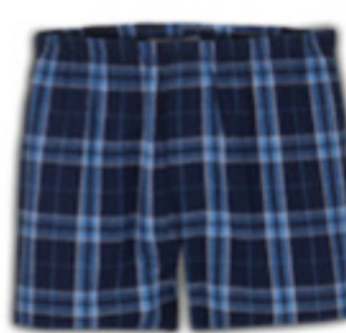
NCP Navy Columbia Plaid