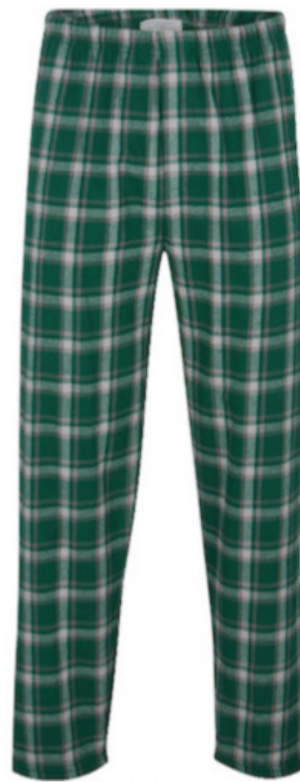
HEH Heritage Hunter Plaid