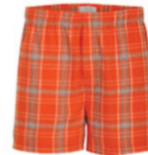
KN1 Orange Kingston Plaid