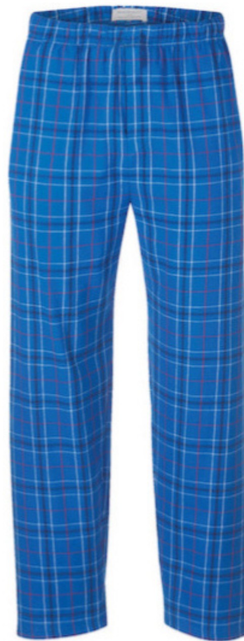
FD3 Royal Field Day Plaid