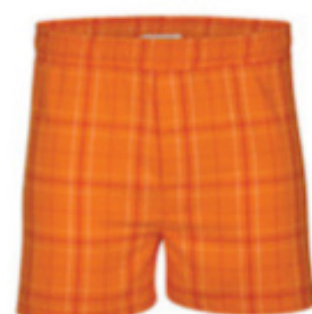
FD4 Orange Field Day Plaid