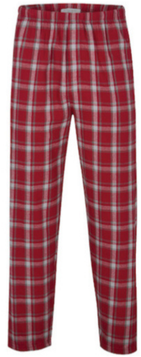
HGP Heritage Garnet Plaid