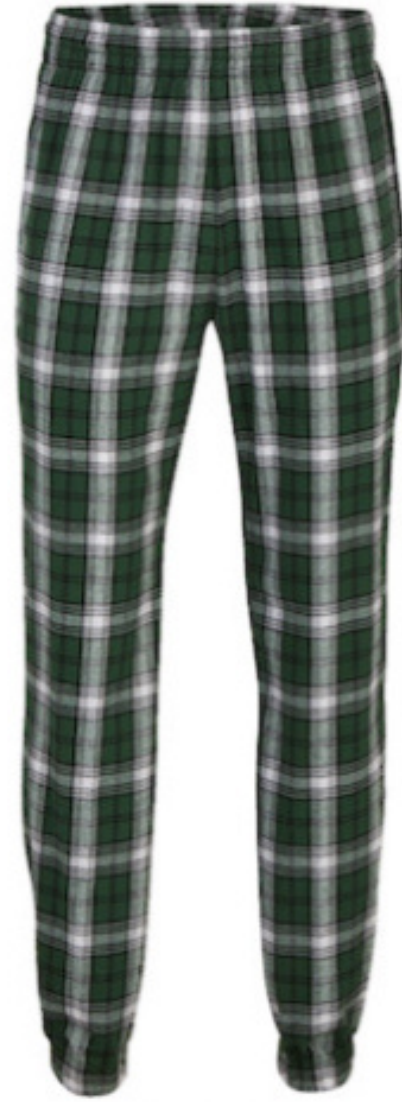
GWP Green White Plaid