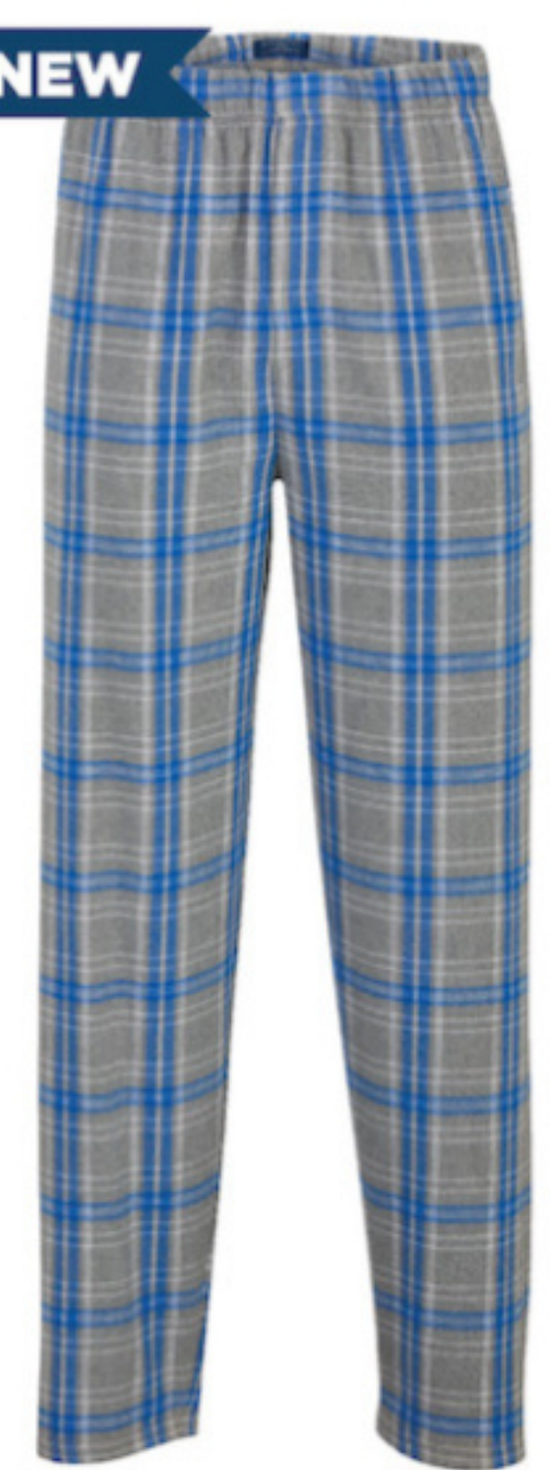
KN4 Oxford Heather Royal Kingston Plaid