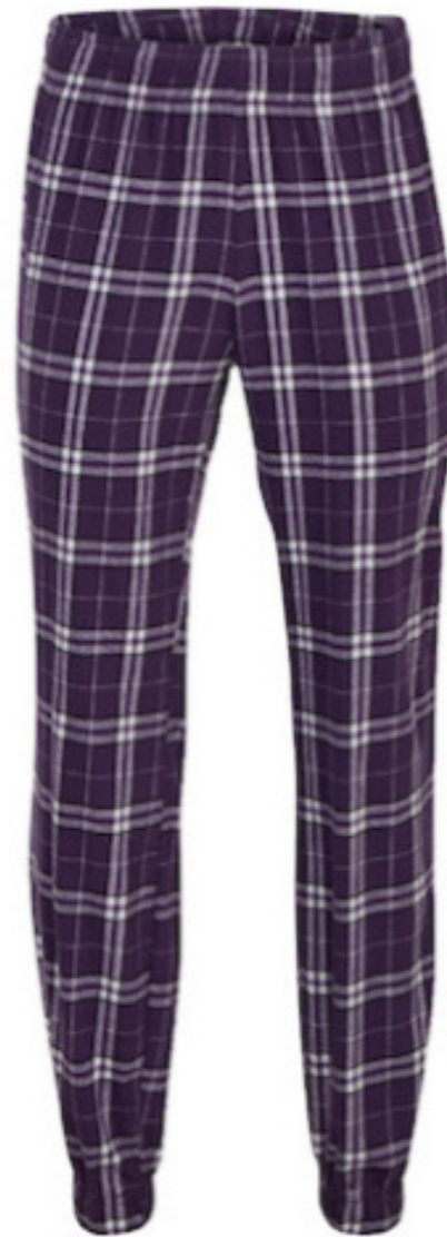
PWP Purple White Plaid