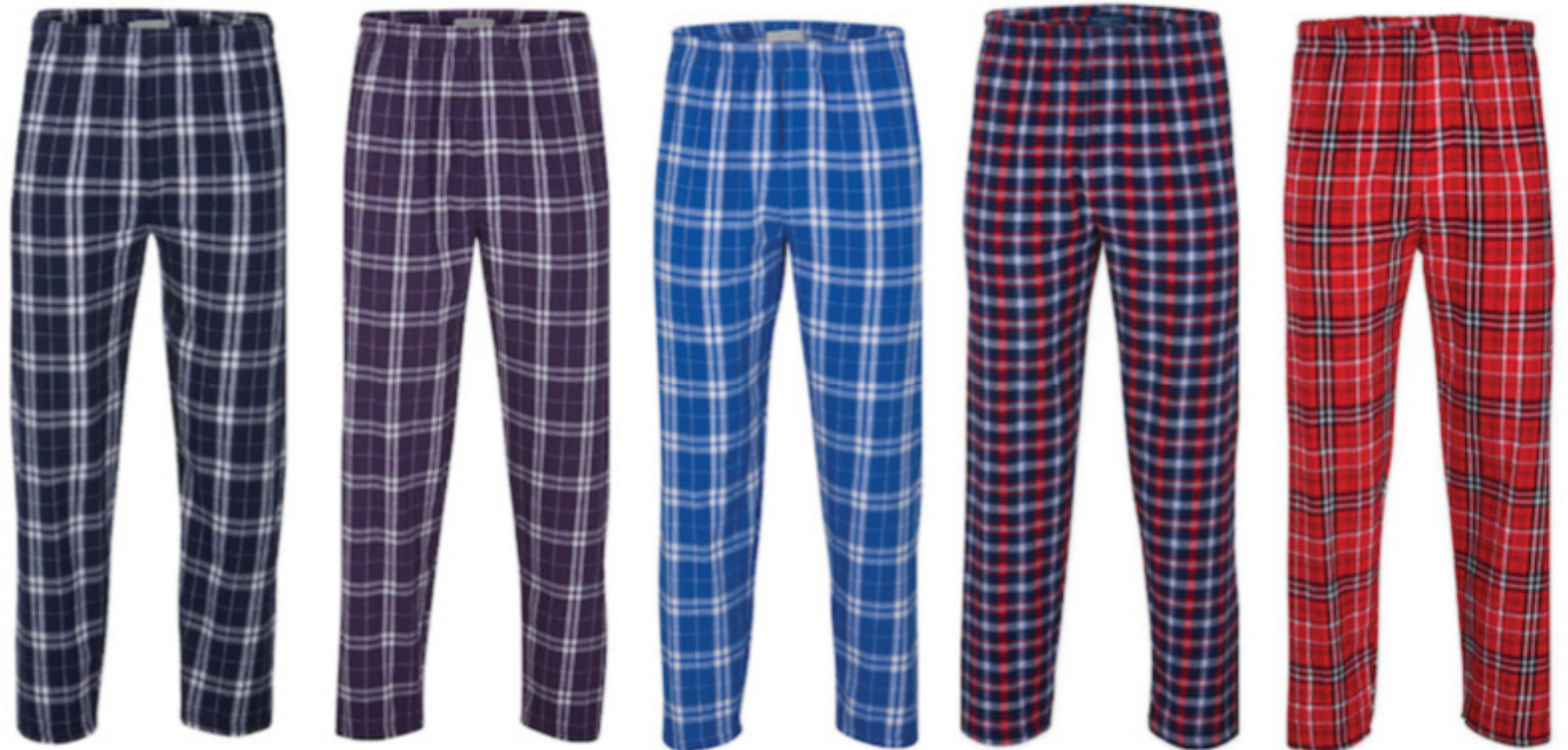
NSP Navy Silver Plaid