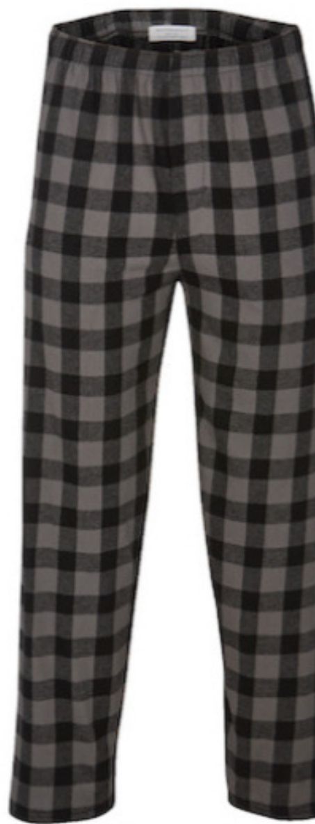
CKB Charcoal Black Buffalo Check