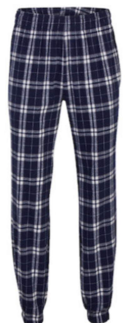
NSP Navy Silver Plaid