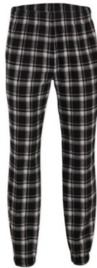
HEB Heritage Black Plaid