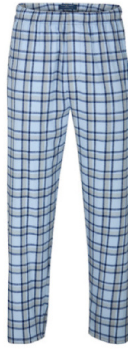
HNC Heritage Carolina Blue Plaid