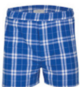
RSV Royal Silver Plaid