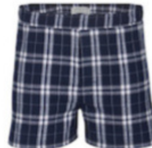
NSP Navy Silver Plaid