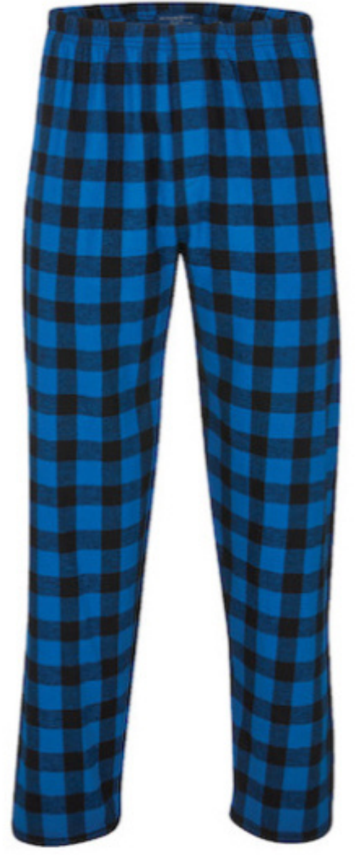
RKB Royal Black Buffalo Check