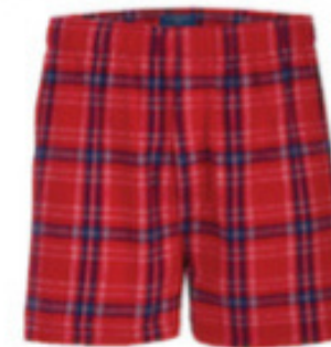
KN2 Red Navy Kingston Plaid