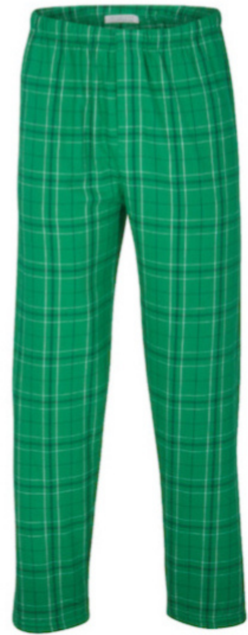
FD2 Kelly Field Day Plaid