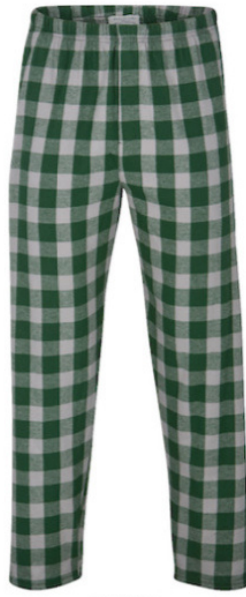
BCG Green Charcoal Buffalo Check