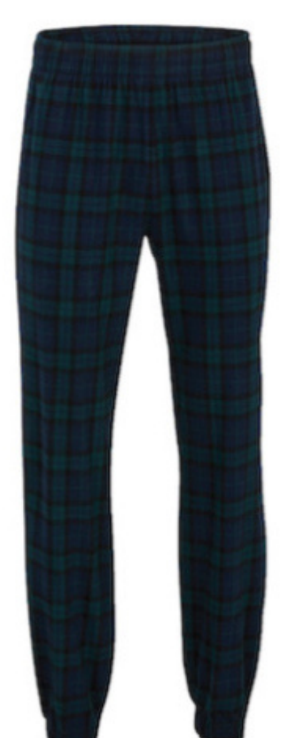
STP Scottish Tartan