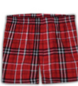
RWP Red White Plaid