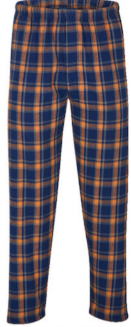
HOG Heritage Navy Orange Plaid