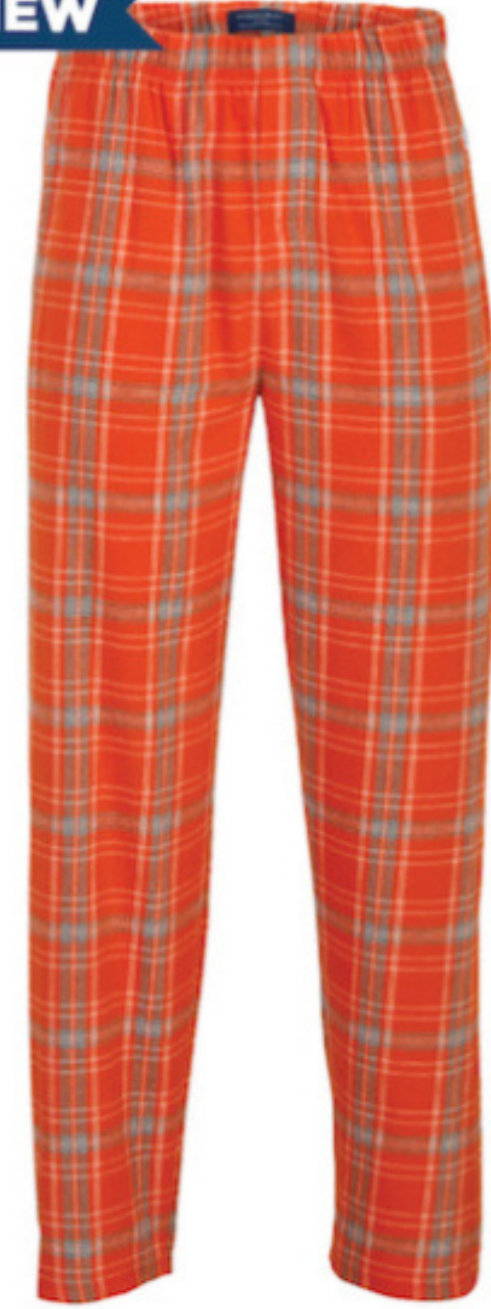
KN1 Orange Kingston Plaid