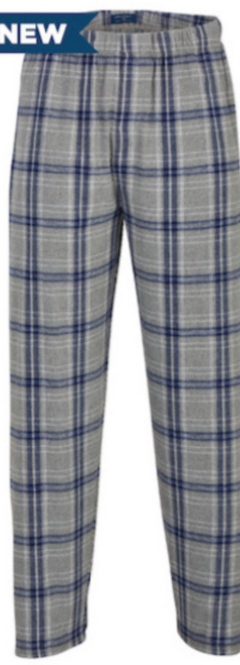
KN3 Oxford Heather Navy Kingston Plaid