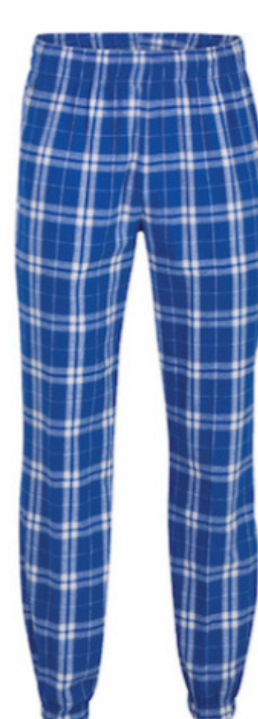
RSV Royal Silver Plaid