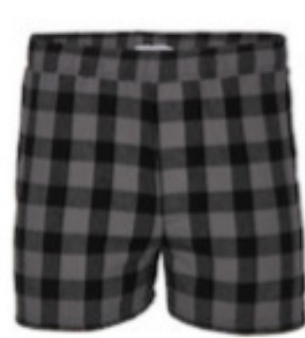
CKB Charcoal Black Buffalo Check