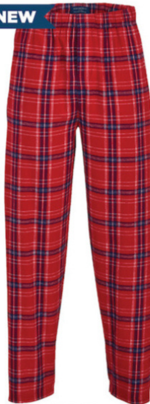
KN2 Red Navy Kingston Plaid