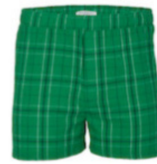
FD2 Kelly Field Day Plaid