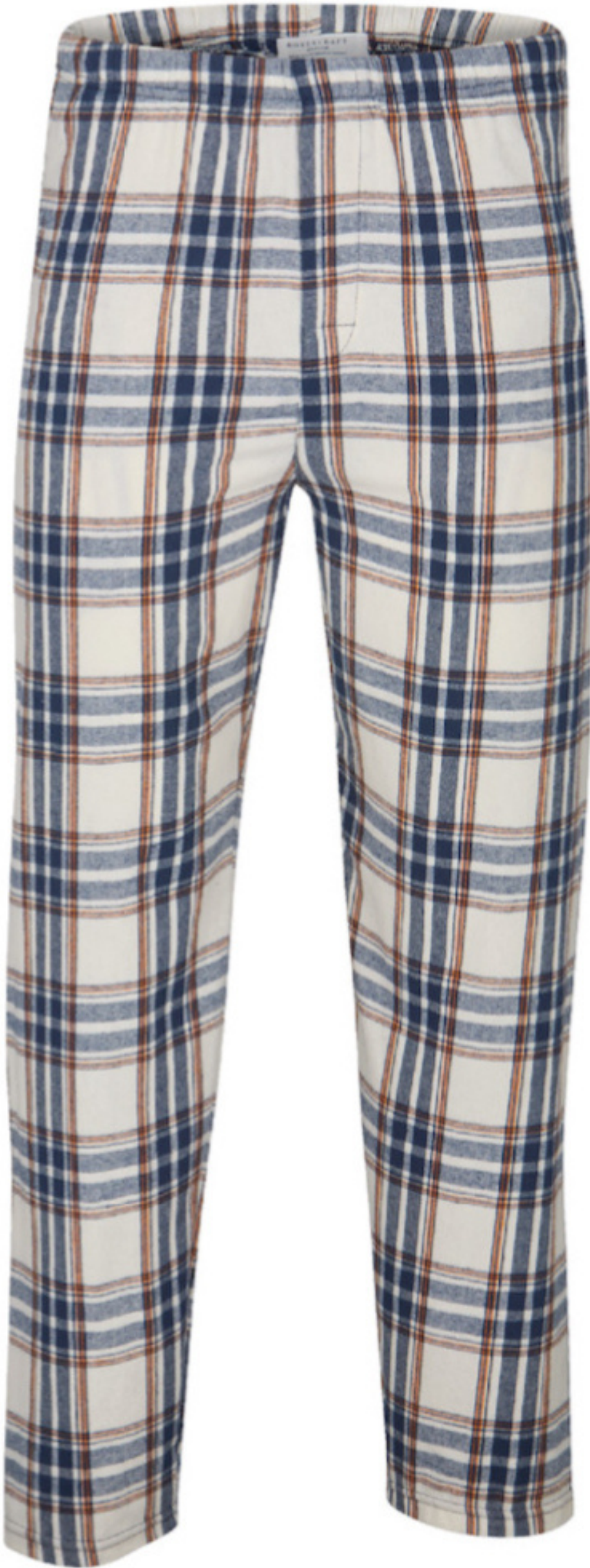
MP1 Orange Indigo Metro Plaid