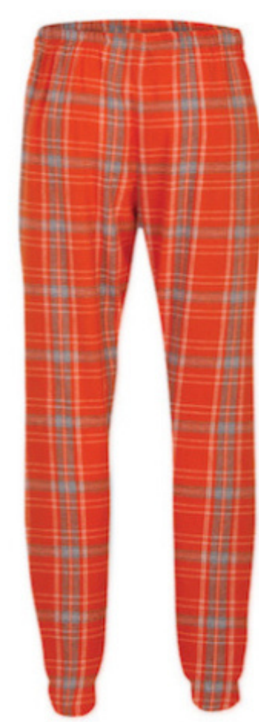
KN1 Orange Kingston Plaid