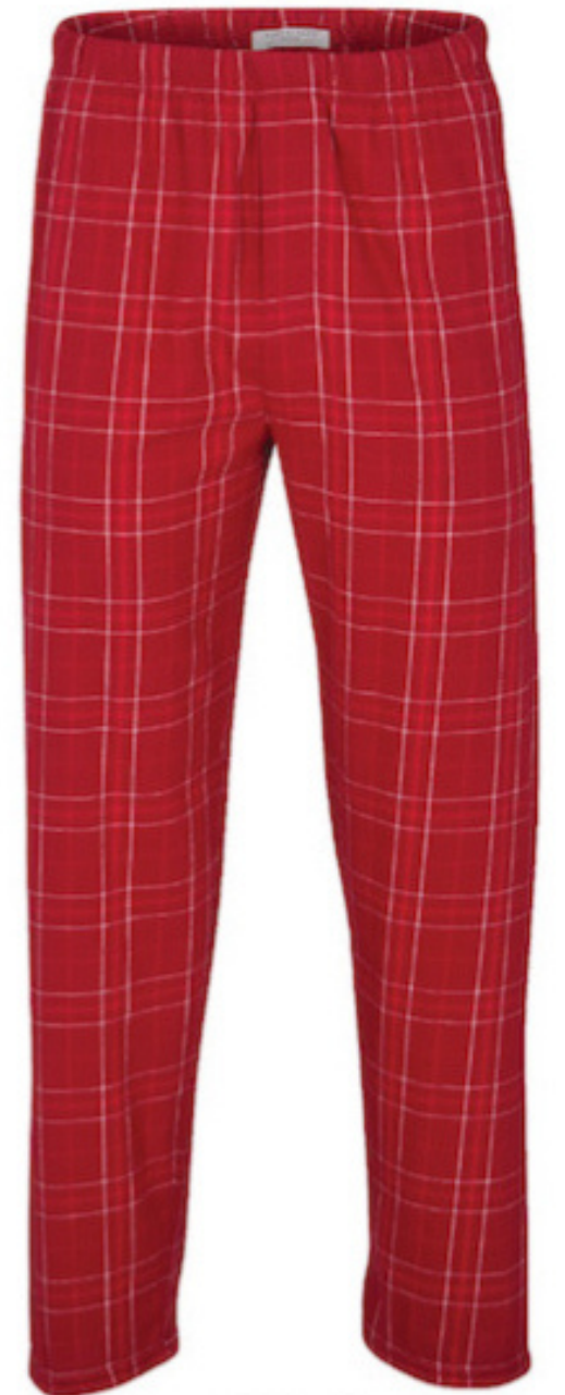
FD5 Crimson Field Day Plaid