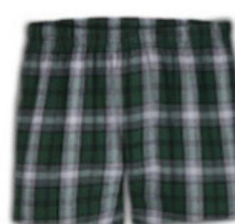
GWP Green White Plaid