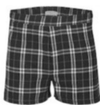
BWP Black White Plaid