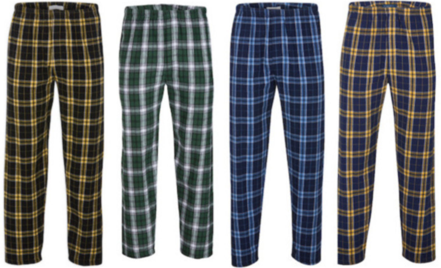
BGO Black Gold Plaid

The plaid pattern is different from the usual checkerboard pattern consisting of squares of colors, it consists of stripes of different colors intersecting each other.