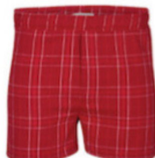
FD5 Crimson Field Day Plaid