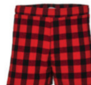
RBB Red Black Buffalo Plaid