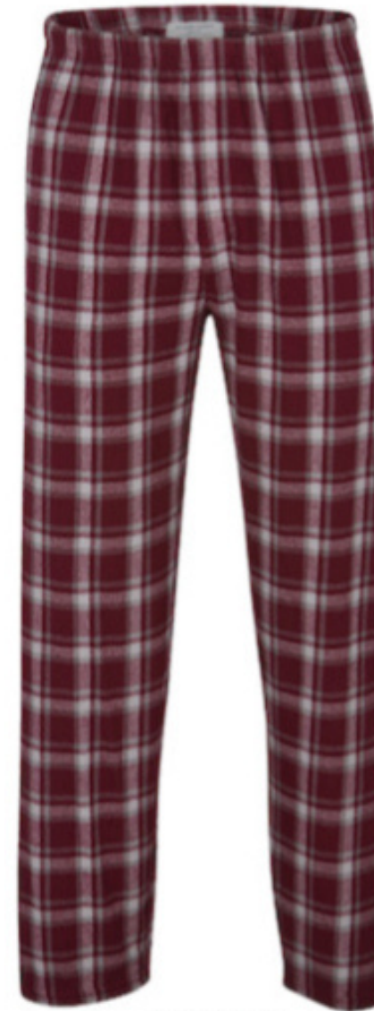
HEM Heritage Maroon Plaid