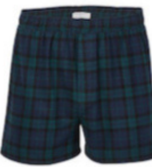
STP Scottish Tartan