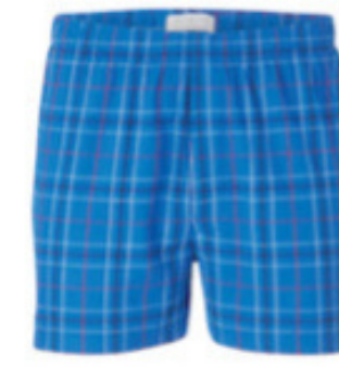
FD3 Royal Field Day Plaid