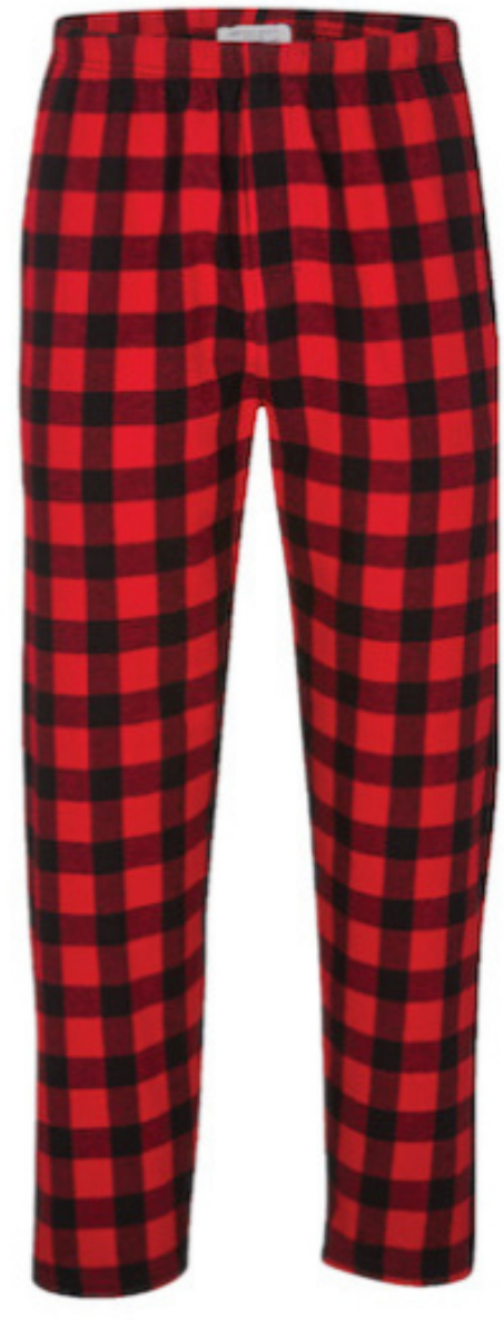
RBB Red Black Buffalo Check