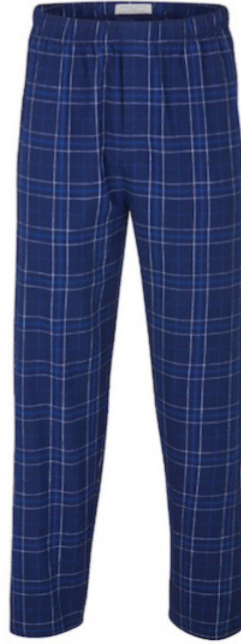
FD1 Navy Field Day Plaid

Minimalist approach to a modern pattern. Bright color palette with white and tonal intersecting lines.