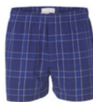
FD1 Navy Field Day Plaid