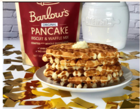
Barlow's Foods 3 in 1 Original Pancake, Biscuit and Waffle Mix 32 oz - 2 Packs