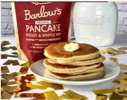
Barlow's Foods 3 in 1 Original Pancake, Biscuit and Waffle Mix - 16 oz